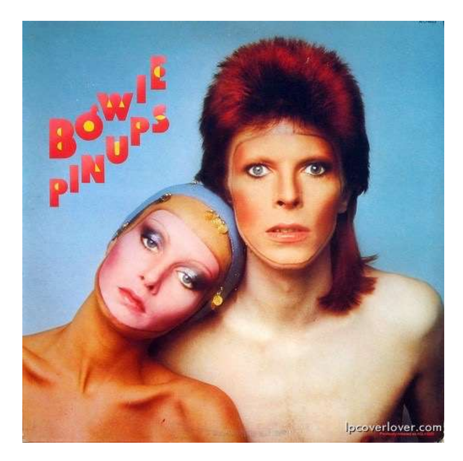
Figure 3 . David Bowie and Twiggy on the cover of Pin Ups de Villeneuve, Justin. Pin Ups . 1973.