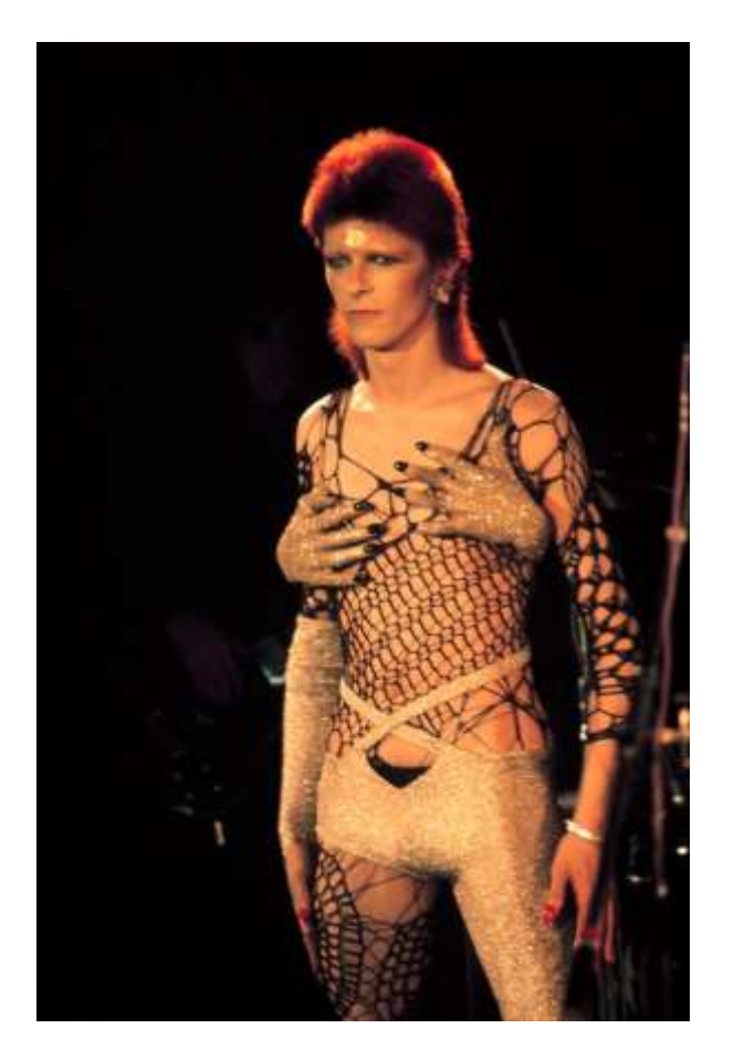
Figure 2 . David Bowie's gender ambiguous costume for The 1980 Floor Show Rock, Mick. The 1980 Floor Show . 1973.